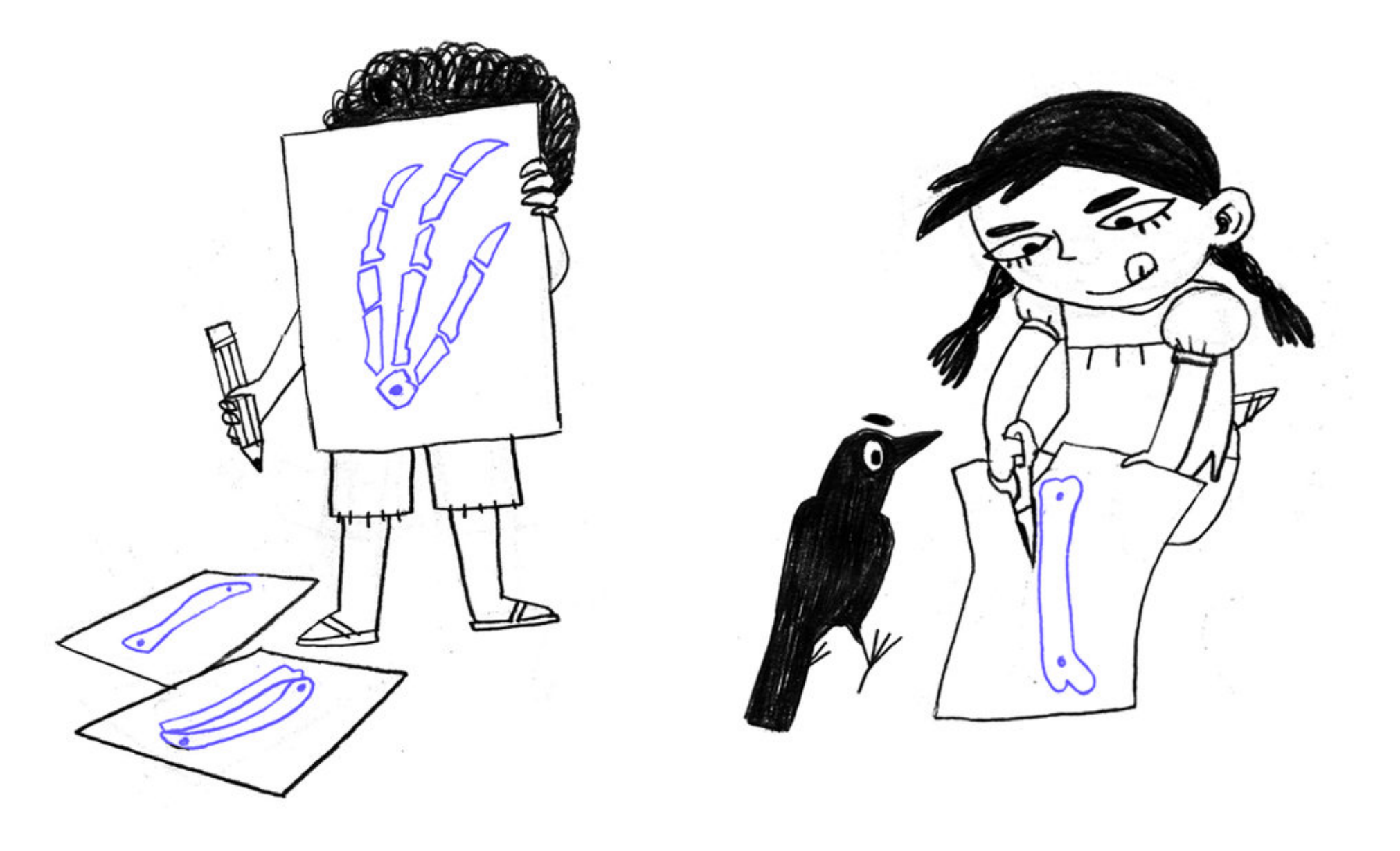
Copy the bones on the previous page into your notebook, cut them out with a pair of scissors, and put them together. You can use the bones to make either a dinosaur or a bird! Or both!