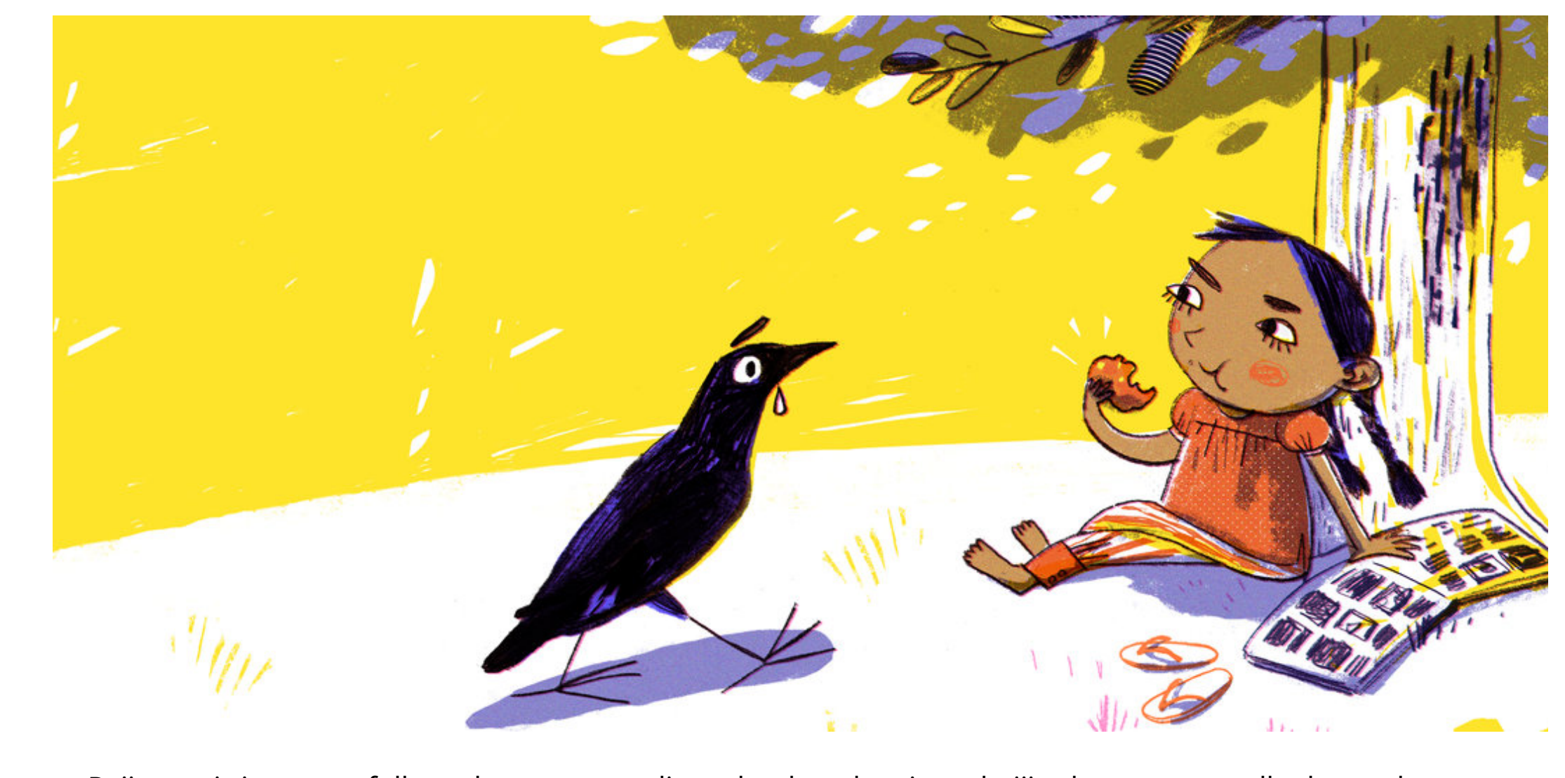
Raji was sitting peacefully under a tree, reading a book and eating a bajji, when a crow walked up to her.