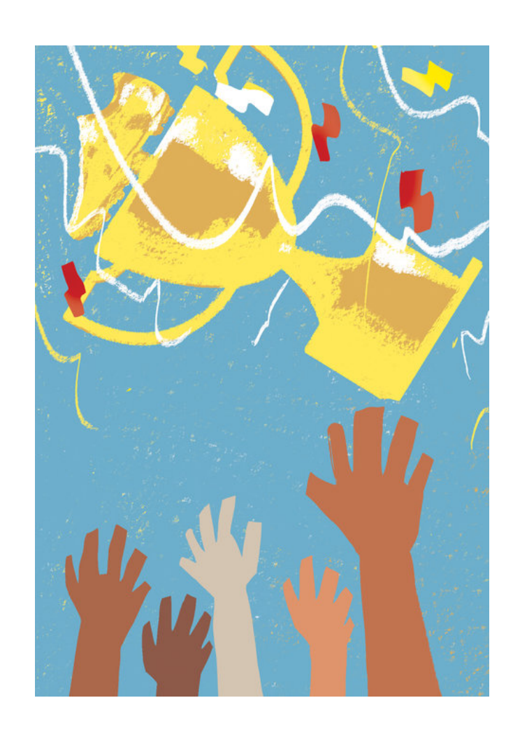
Sniffle, sniffle. They've WON! THEY'VE WON THE FAMOUS FOOTBALL CUP!