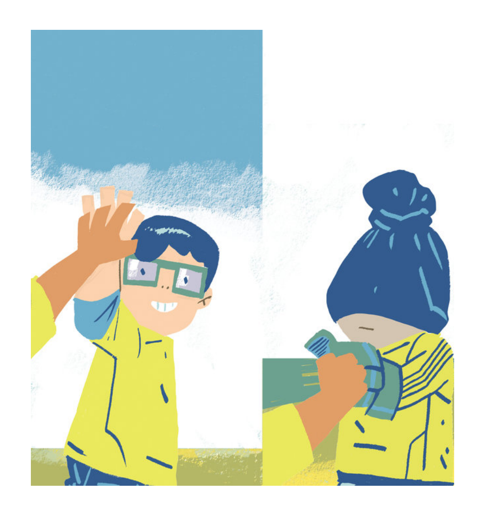
Sniffle, sniffle. "High five, Rustam!" Sniffle, sniffle. "Good game, Gurmeet!"